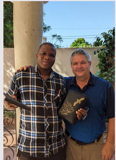
The HOH Team Visits Guinea-Bissau | More photos on the back page